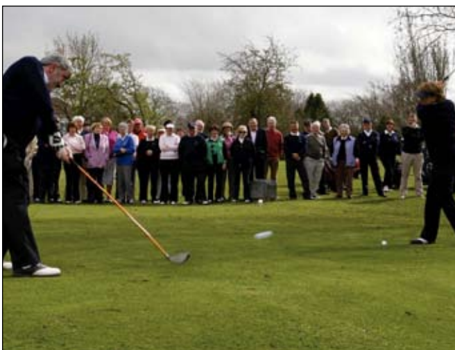
Captains' Drive - In